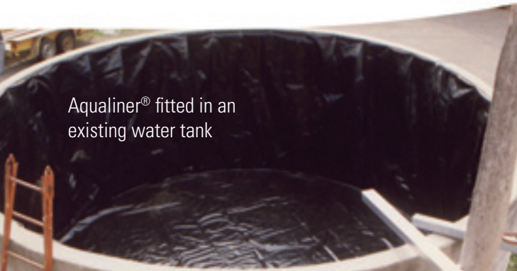
Aqualiner® fitted in an existing water tank

Rejuvenate your leaking tank by fitting a custom manufactured Aqualiner®. Our Aqualiner® can be tailor made to fit tanks of any size or shape.