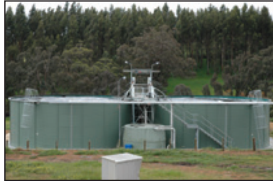
Boundary Wines, Western Australia. Bio Mass Tanks.

One of GALAXY™ tanks' best selling points is its versatility. Not only has it proven its worth in rural and ranch applications, it has established the same reliable reputation in the industrial and commercial workplace.