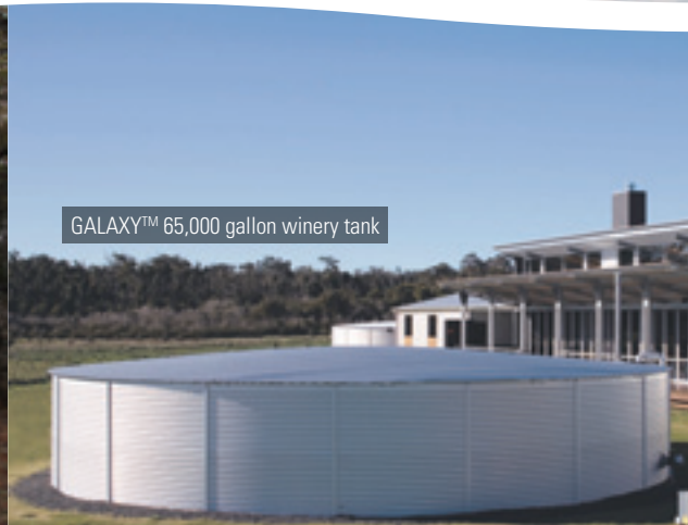
GALAXY™ 65,000 gallon winery tank

A typical GALAXY™ tank kit is less than 5% of the installed size, making transportation of your new GALAXY™ tank easy - even to the most remote locations. GALAXY™ tanks are quick to install and only require a small installation footprint.