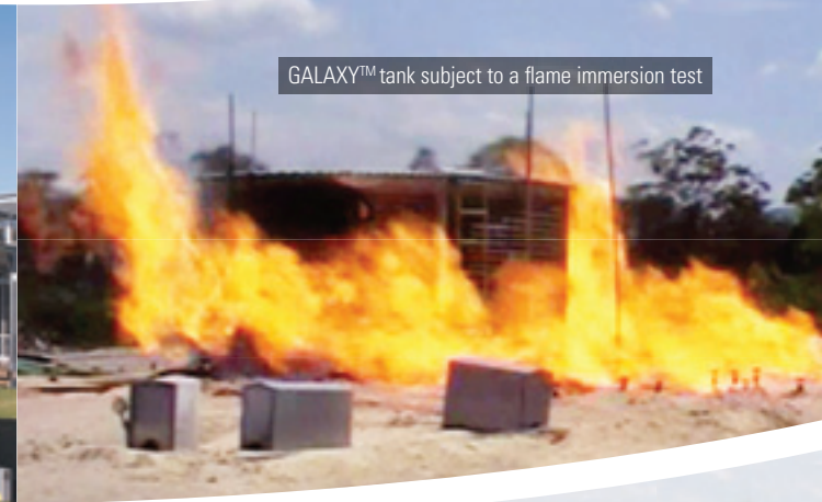
GALAXY™ tank subject to a flame immersion test

Anecdotal evidence already exists to suggest steel water tanks offer greater protection to both residential and commercial property in the event of a bush fire (wild fire) than alternative materials because of its non-combustibility.