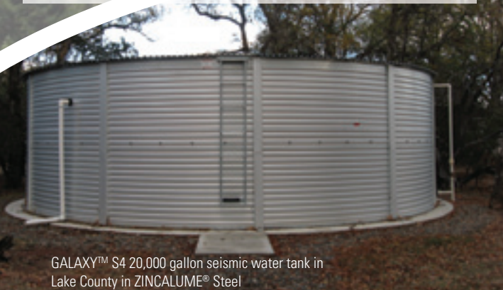
GALAXY™ S4 20,000 gallon seismic water tank in Lake County in ZINCALUME® Steel

The GALAXY™ range of water tanks is a cost-effective water storage solution which is the result of years of continuing research and development and state-of-the-art manufacturing techniques. All GALAXY™ domestic tanks are fitted with our exclusive 5-layer Aqualiner® approved to the American NSF 61 Standard for contact with potable (drinking) water. Backed with a conditional 10 year warranty, our GALAXY™ tanks are designed to meet your budget without compromise in quality.